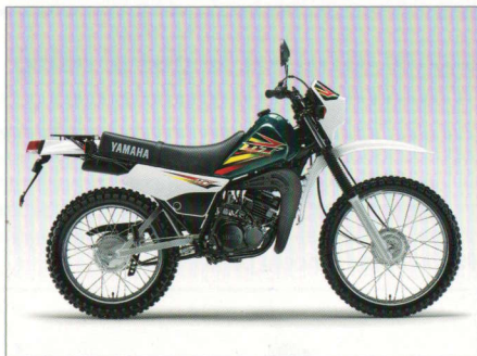
DARK CYAN METALLIC 8 (DCM8)