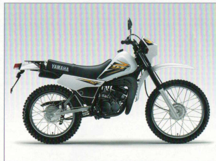
BLUISH WHITE COCKTAIL 1 (BWC1)