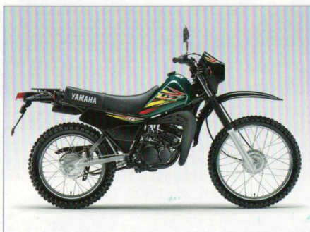
DARK CYAN METALLIC 8 (DCM8)