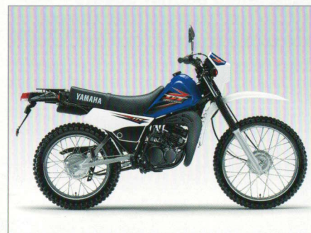
DEEP PURPLISH BLUE METALLIC C (DPBMC)