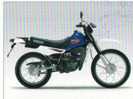
DEEP PURPLISH BLUE METALLIC C (DPBMC)