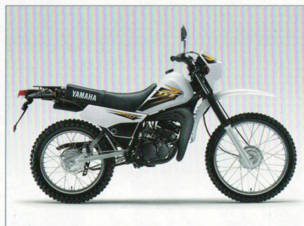
BLUISH WHITE COCKTAIL 1 (BWC1)